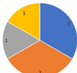
NUMBER OF LATE PUPILS